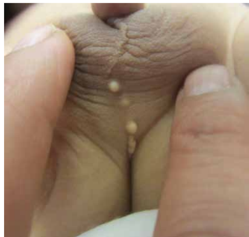
Figure 1: Median Raphe Cysts

A 14 1/2-month-old boy presented with a history of several white papules in the midline of the scrotum and ventral surface of the penis noticed from 3 months of age and possibly since birth. Other than a NICU stay for prematurity and an egg white allergy, he was healthy. Physical examination revealed several white-yellow papules on the midline of his scrotum, and one lesion on the base of his penis [Figure 1]. He had no hypospadias, and no other midline lesions were noted. Based on the site and appearance of the lesions, a diagnosis of median raphe cysts was made.